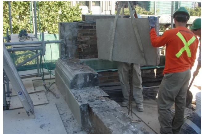
Stone Parapet Restoration in Progress

Scope: Design, Specification/Tender, Contract Administration, Quality Observations, Building Envelope Engineering.