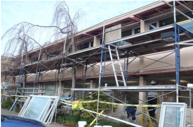
Window Replacement in Progress