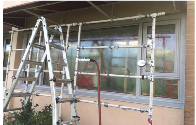
Field Testing of a New Window