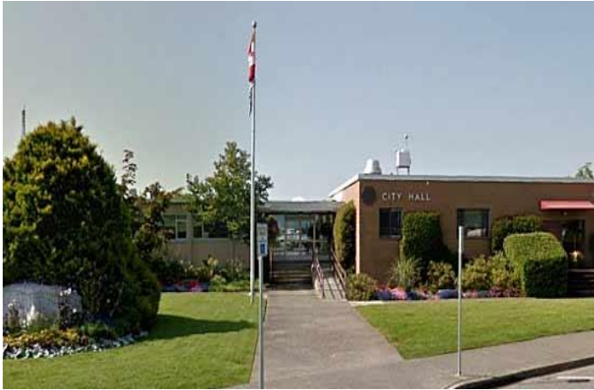
Front of the Building