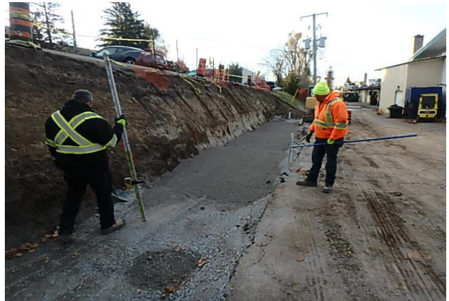
Preparation of Base and Subbase for the Retaining Wall