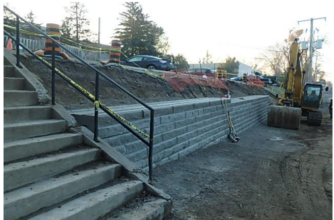
Widening of the Loading Area to Accommodate Trucks Turning Radius

Scope: Design, Specification/Tender, Contract Administration, Quality Observations Services Provided: The loading area has issues with the trucks turning radius. The area was designed for new retaining wall to accommodate extra space for tucks turning. Maintain the slope and allow subdrain to address any frost heaving concerns. Construction Value: $331,000.00