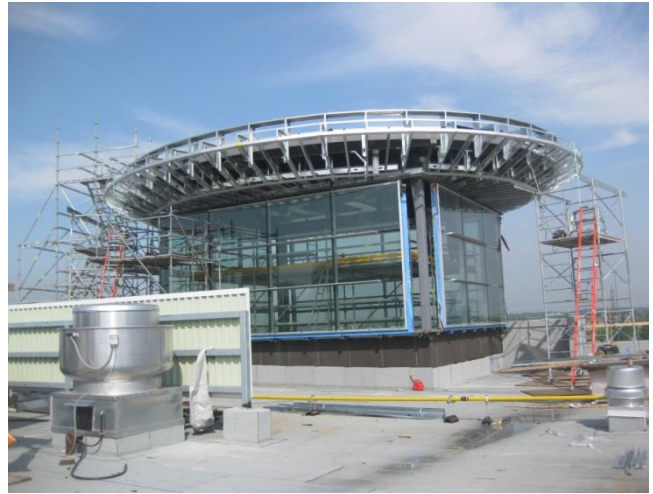
Construction of new entrance feature