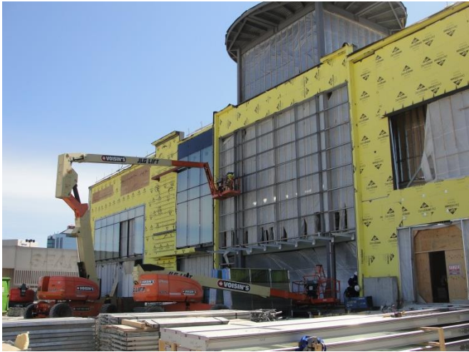
Installation of curtain wall framing at the main entrance of new expansion