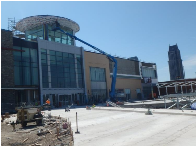
Cladding of new entrance feature