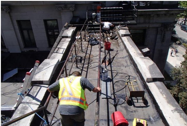
Roof Replacement in Progress