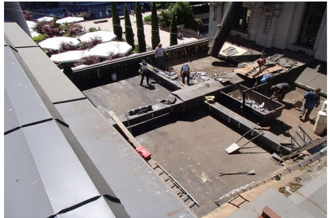
Roof Replacement in Progress