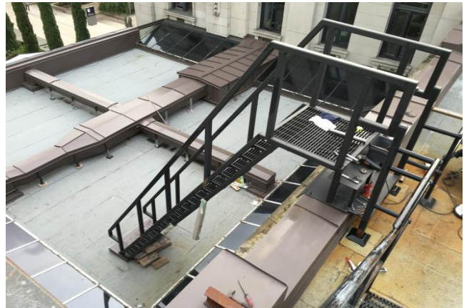
Ship's Ladder Installation

Scope: Drawings, Details, Specifications and Quality Observations for Roof Replacement and Fall Protection Upgrades