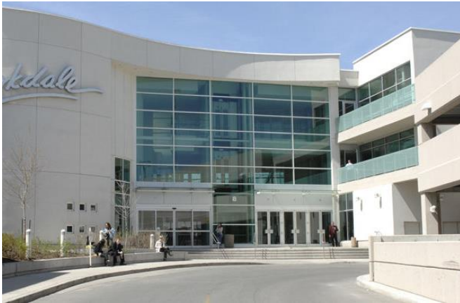
High Volume Large Shopping Centre in Toronto