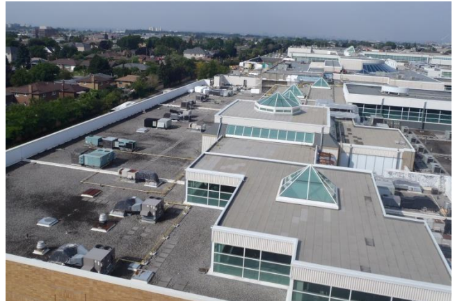
On-Going Rehabilitation of Roofing Systems Utilizing a Sustainable Long Term Lightweight Insulated Concrete System